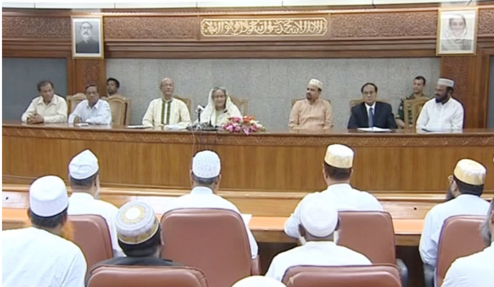
The honorable Prime minister Shekh Hasina speaking in a meeting with B.J.M at her office