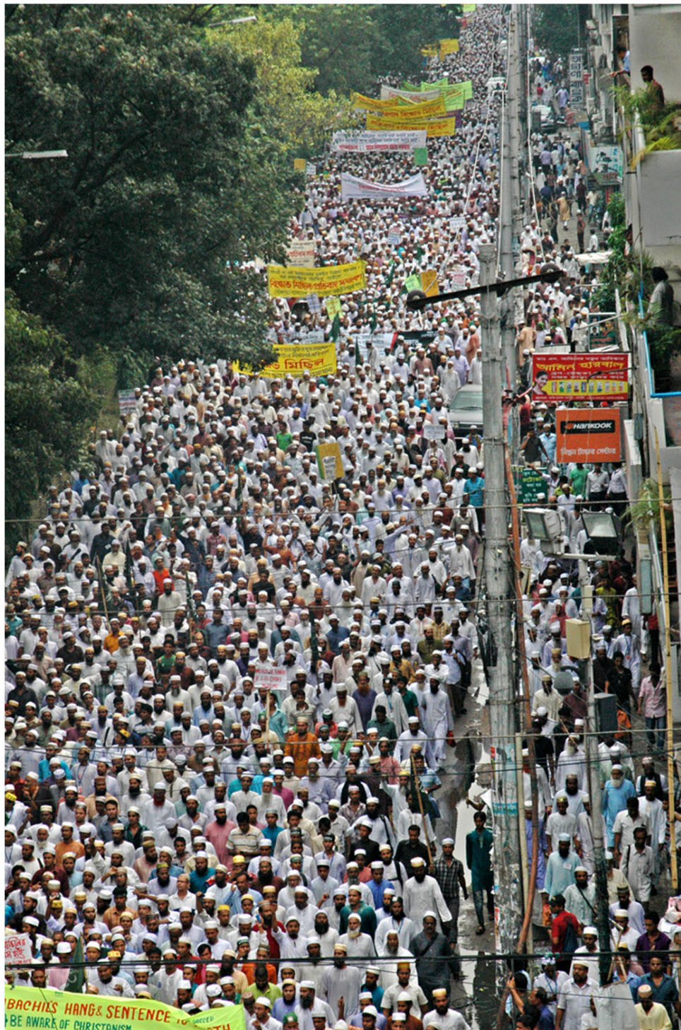
Protest Procession against humiliation of Prophet (SA).