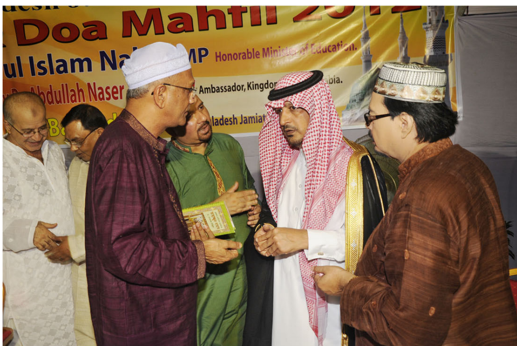
At the Iftar party of B.J.M