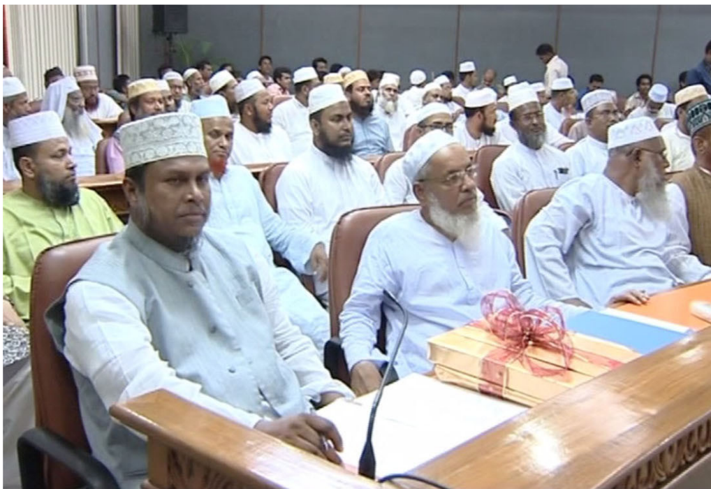
Audience at a B.J.M the meeting with the honorable Prime minister Shekh Hasina at her office