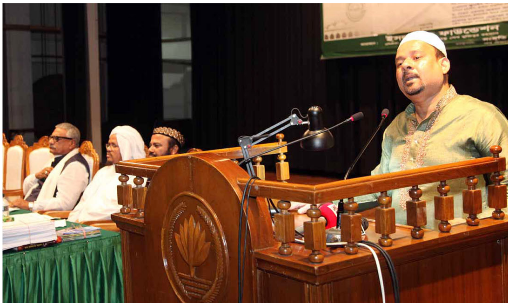
Speaking at a meeting. Honorable minister for home affairs Shamsul Haque Tuku was present.