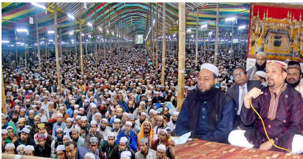
Attending a meeting at Manikgonj