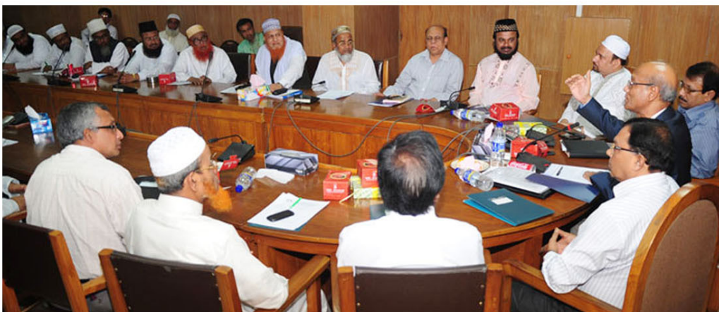
Round table meeting at ministry of education, Minister for Education Mr. Nurul Islam Nahid MP speaking