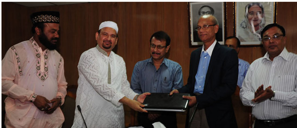
Handing over laptop to the honorable Minister for Education Mr. Nurul Islam Nahid MP