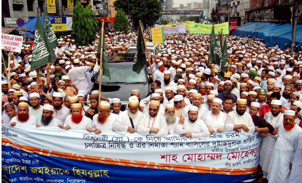
Protest Procession against humiliation of Prophet (PBUH).