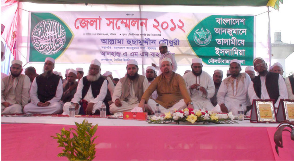
Attending meeting at Fultoli Darbar