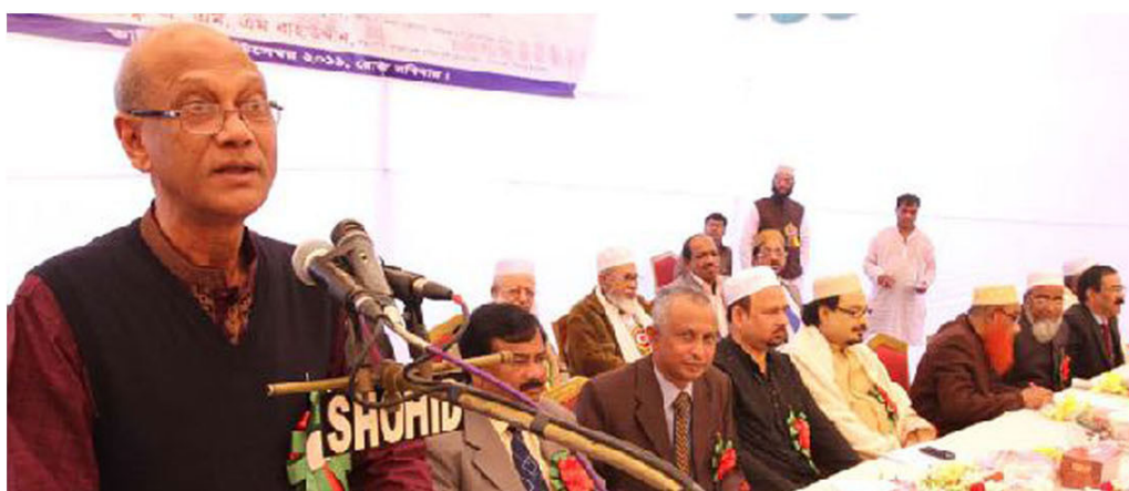
Minister for Education Mr. Nurul Islam Nahid MP speaking at a B.J.M conference