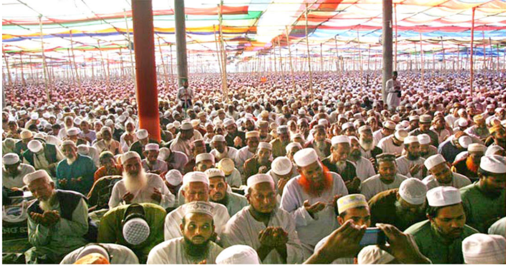
Audience at Sarsina Darbar.