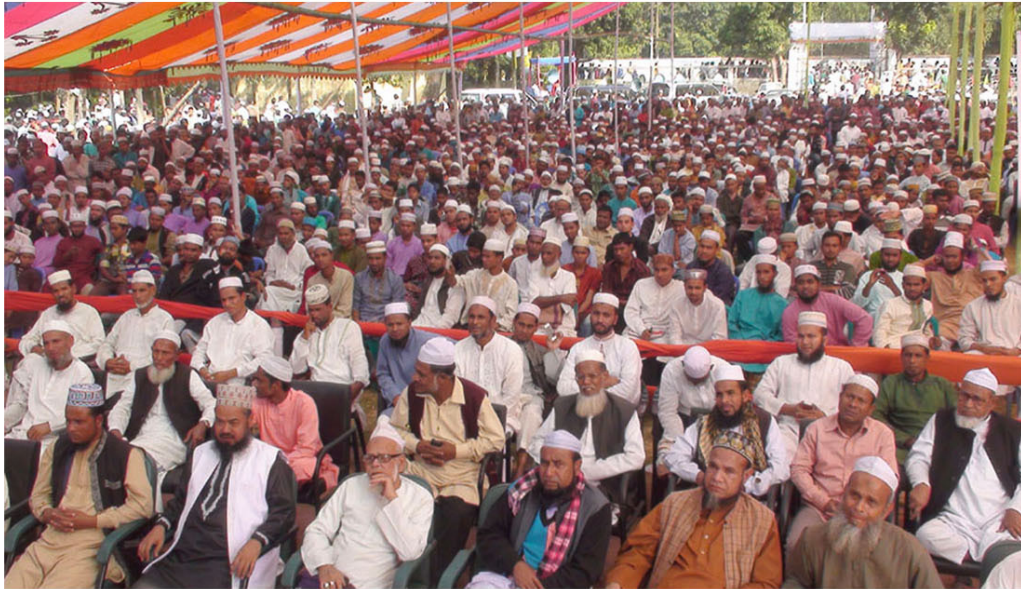
Audience at Fultoli Darbar